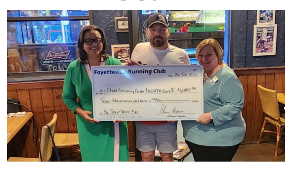
The Fayetteville Running Club donated $4000 to WORTH Court and the Child Advocacy Center from the Human Trafficking 5 K Run held in January