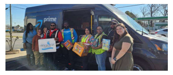
Employees from the WNC6 Amazon Warehouse in Fayetteville brought a van load of goodies to the CAC for the children and our office.