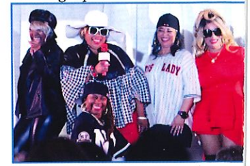
The 5 Presidentaes