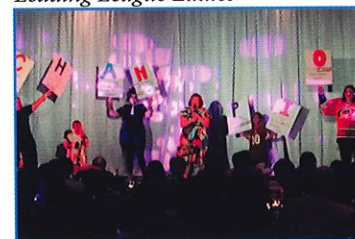
Law and Order