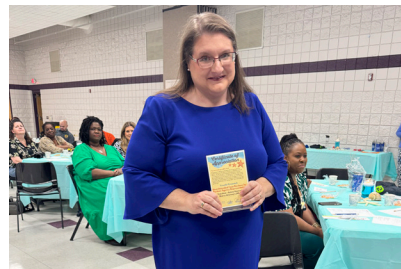
100% Agency Attendance at Case Review District Attorney's Office