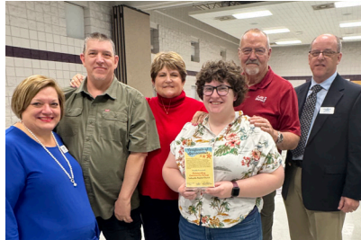
Volunteer Group of the Year—Lafayette Baptist Church