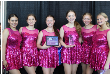
Team Blaze (THE FIREHOUSE Eastover's Studio of Performing Arts)