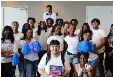
Golden Stars Performance Troupe (E.E. Smith High School)