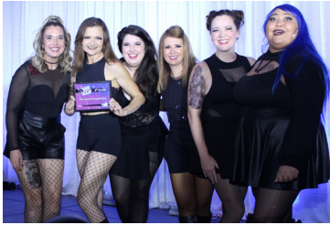
The SIX Merry Murderesses