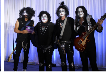
Fayetteville's KISS Army