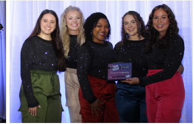
Queen B's (Rainbow Pediatrics)