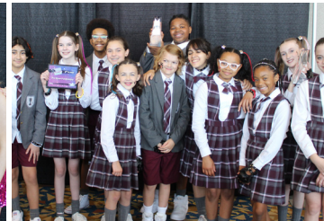
The Miracles (Cape Fear Regional Theatre)